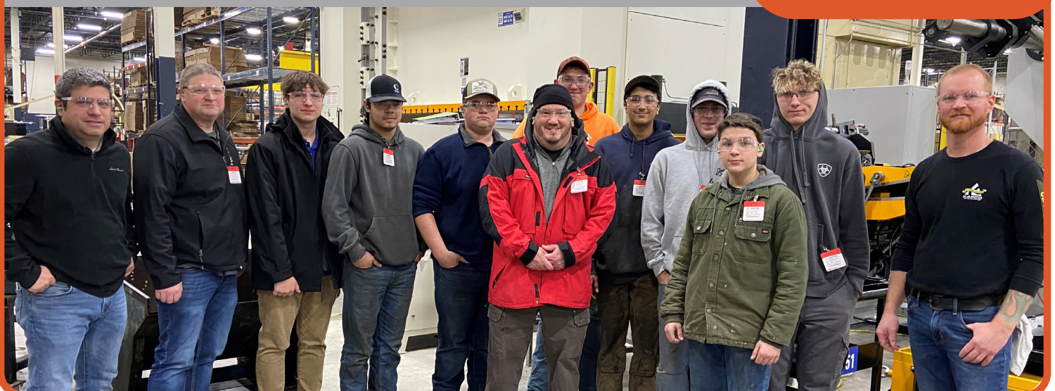
Tour-It-Tuesdays hosted by Kapco Metal Stamping.